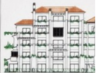
SITUACION EN FACHADA